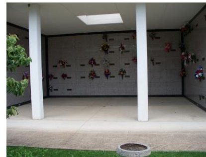
Alcove 1 & 5