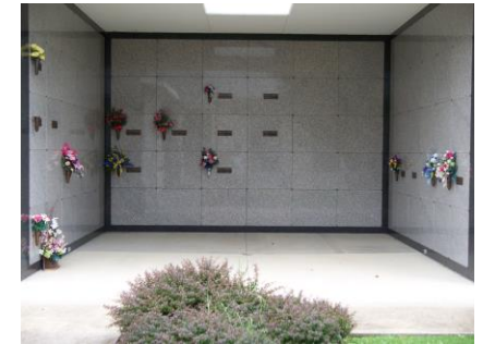
Alcove 2,3, & 4

**Price subject to change without notice. Call for current price**